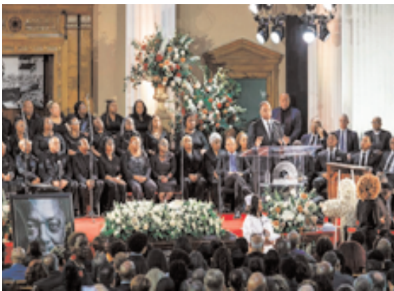
Private family funeral for Rev. Jesse Jackson

CHICAGO — A day after former presidents, sitting governors and local Chicago residents alike attended a vibrant, televised celebration for the late Rev. Jesse Jackson Sr., the family and friends who knew him best hosted a more intimate gathering Saturday to grieve the civil rights leader at his organization's headquarters.