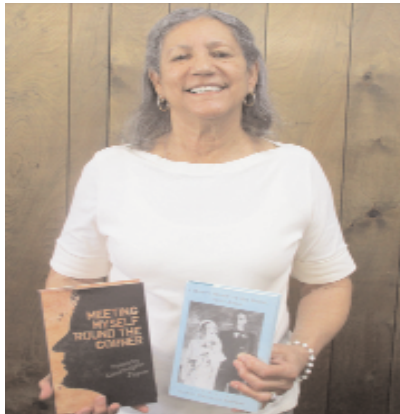
Poetry Book Order Form