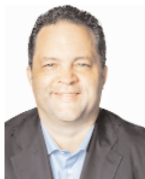
By Ben Jealous

Last week I wrote about something my father, who is white, has said for years: when many white Americans hear the phrase "white privilege," they respond by listing all the ways their lives have been hard. But if you talk about "white advantage," the conversation changes. Advantage is measurable. It doesn't erase suffering. It simply acknowledges that race still tilts the system.