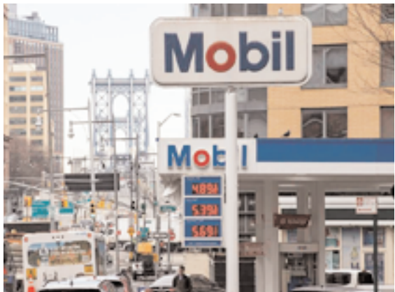
Higher gas prices on gas station sign

Last week, President Donald Trump shocked the world when he authorized targeted strikes against Iran while still negotiating terms over Iran's nuclear capabilities. The consequences for this war are already being felt stateside as gas prices and mortgage rates have increased.