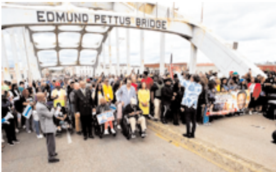
People crossing the Edmund Pettus bridge on Sunday